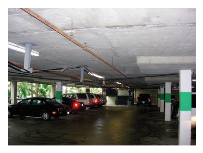
Fig. 15 – A Single Harp Two-Way EPT System