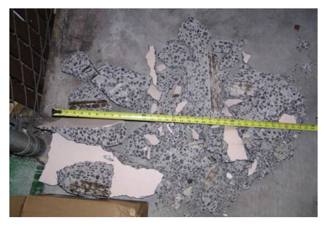
Fig. 1 – Dislodged Concrete