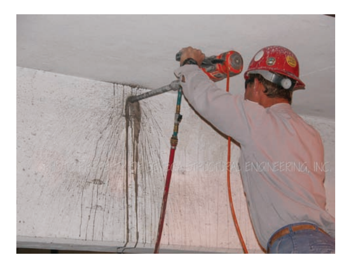
Fig. 12 – Drilling Through an Existing Post-Tensioned Beam