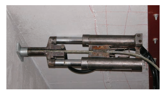
Fig. 5 – The Underside of a Hydraulic Jack

However, the same test will give inaccurate results if friction exists along the strand, or if the strand has bonded due to corrosion buildup. This is typically the case when the only protection for the tendons is wrapped paper. What is really being measured by the jack is the sum total of all resistance to movement of that tendon. This includes the temporary bond to the concrete due to rust and corrosion, interlock of the corrosion buildup and concrete, friction of the un-greased tendon (the paper rarely is adequate to maintain the grease) against the concrete as well as any remaining prestress.