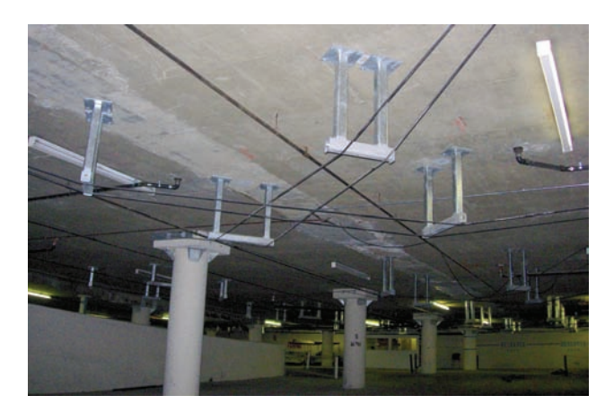
Fig. 14 – A Double Harp Two-Way EPT System

In an EPT application it is always necessary to drill through the existing concrete in order provide a path for the tendons and an anchorage location. If the existing structure is post-tensioned it may be necessary to x-ray in order to prevent damaging existing tendons.