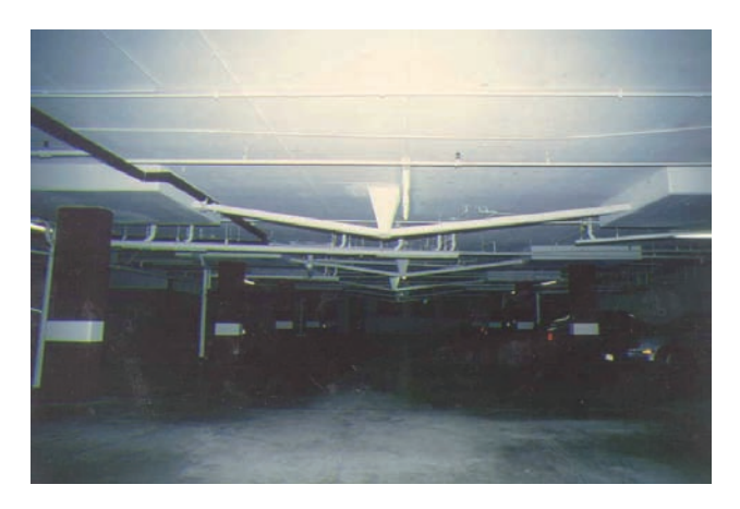
Fig. 16 – Fireproofed EPT Tendons and Hardware

primary or secondary reinforcement. The requirement may also depend upon whether or not the concrete cover over the original tendons satisfies today's fire rating requirements.