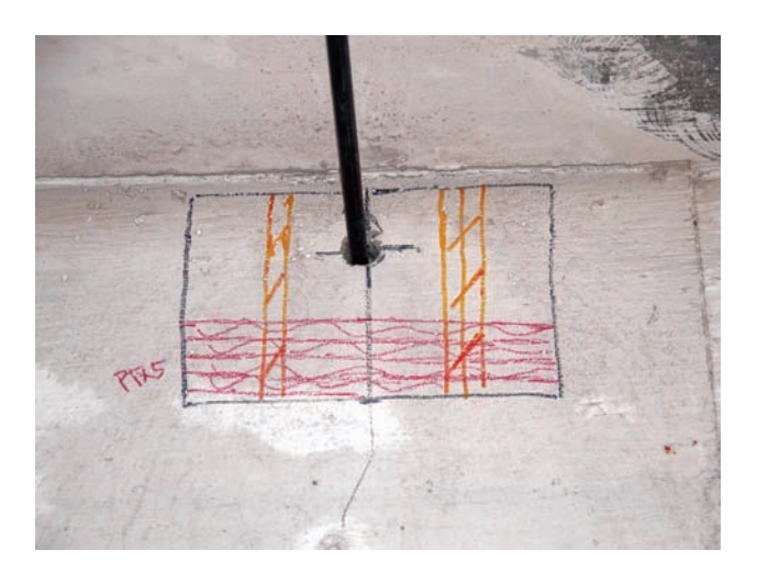
Fig. 11 – X-Ray Markings on a Existing Post-Tensioned Beam