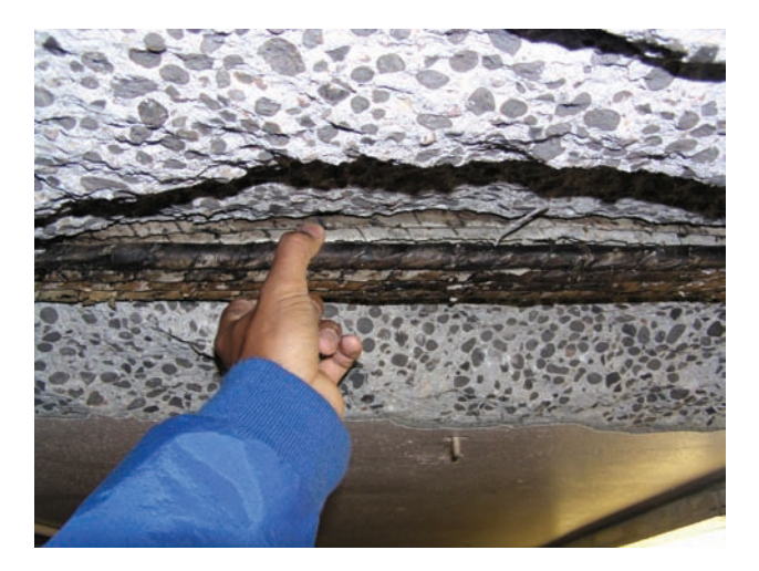
Fig. 6 - Broken Tendons Being Moved By Hand

Another method of evaluating the tendons is to carefully wedge a flat-head screwdriver between the wires at attempt to twist the wires apart. If they move easily, then there has almost certainly been a loss of force in the 7-wire strand.