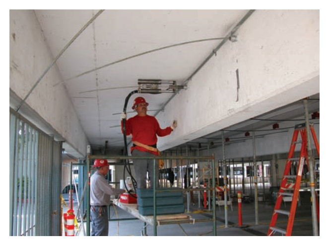
Fig. 13 – Stressing the Galvanized Tendons