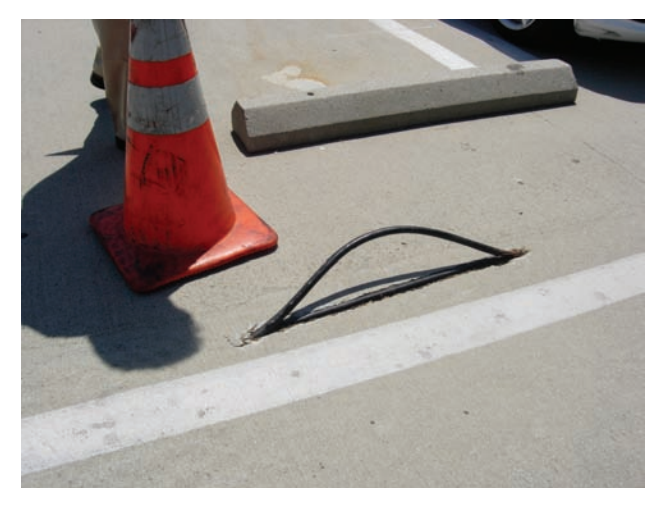
Fig. 4 – A Broken Tendon in Extruded Sheathing

It is common, if access is available, to test the residual prestress in a strand in a greased extruded sheathing by applying a hydraulic jack to the remaining tail at the anchor and stressing until there is movement in the wedges or tendon. At the gauge pressure where the strand begins to elongate it is fair to assume that this is the active prestress in the tendon.