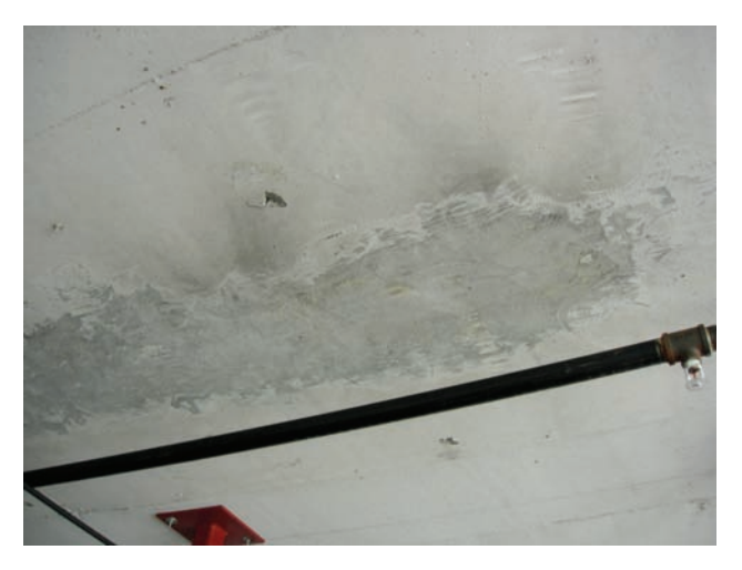
Fig. 8 – Patched Concrete

External post-tensioning is the process of placing tendons and hardware below the slab and stressing the tendons to effectively jack the slab up. The benefit of the stressed tendons is two-fold. First, an active "balancing" force is applied to the slab to offset the effects of the gravity loads. Secondly, the harped or double harped shape of the tendons provides the added strength of a truss, with the post-tensioning as the bottom chord and the concrete as the top chord.