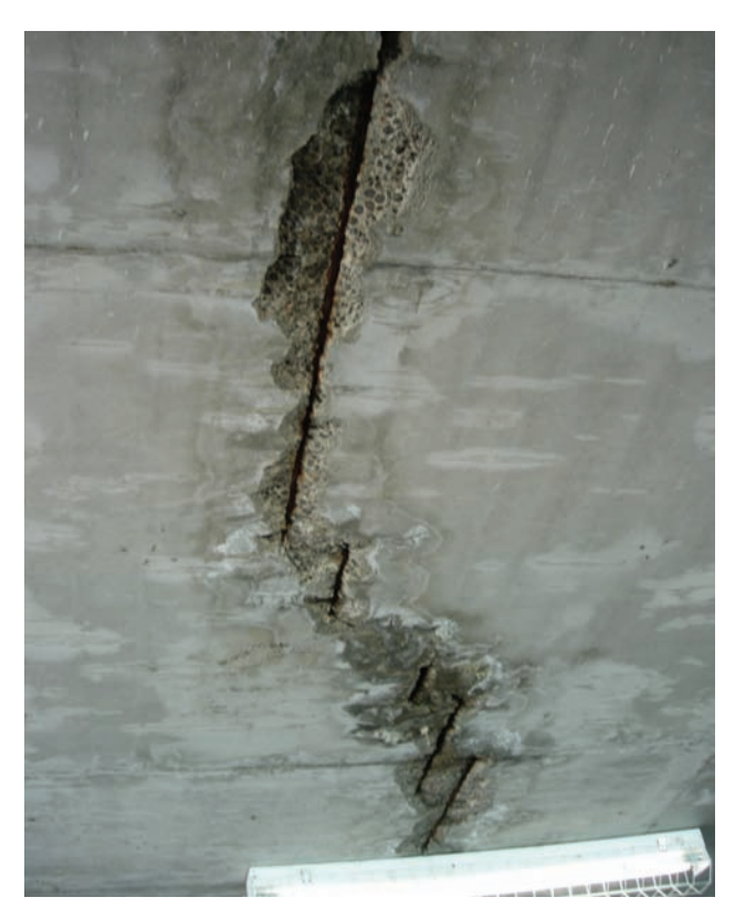
Fig. 3 – Water Staining, Rust and Efflorescence at Corroded Reinforcing