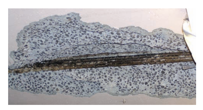
Fig. 2 – Corroded Tendons