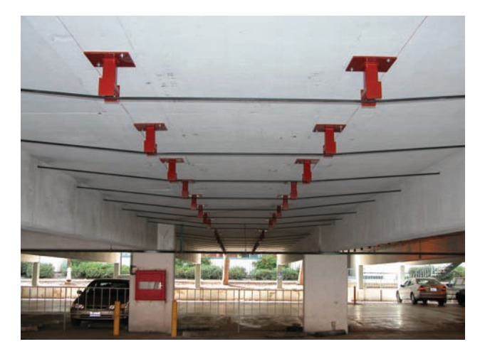
Fig. 10 – Double Harped External Post-Tensioning in a One-Way Slab